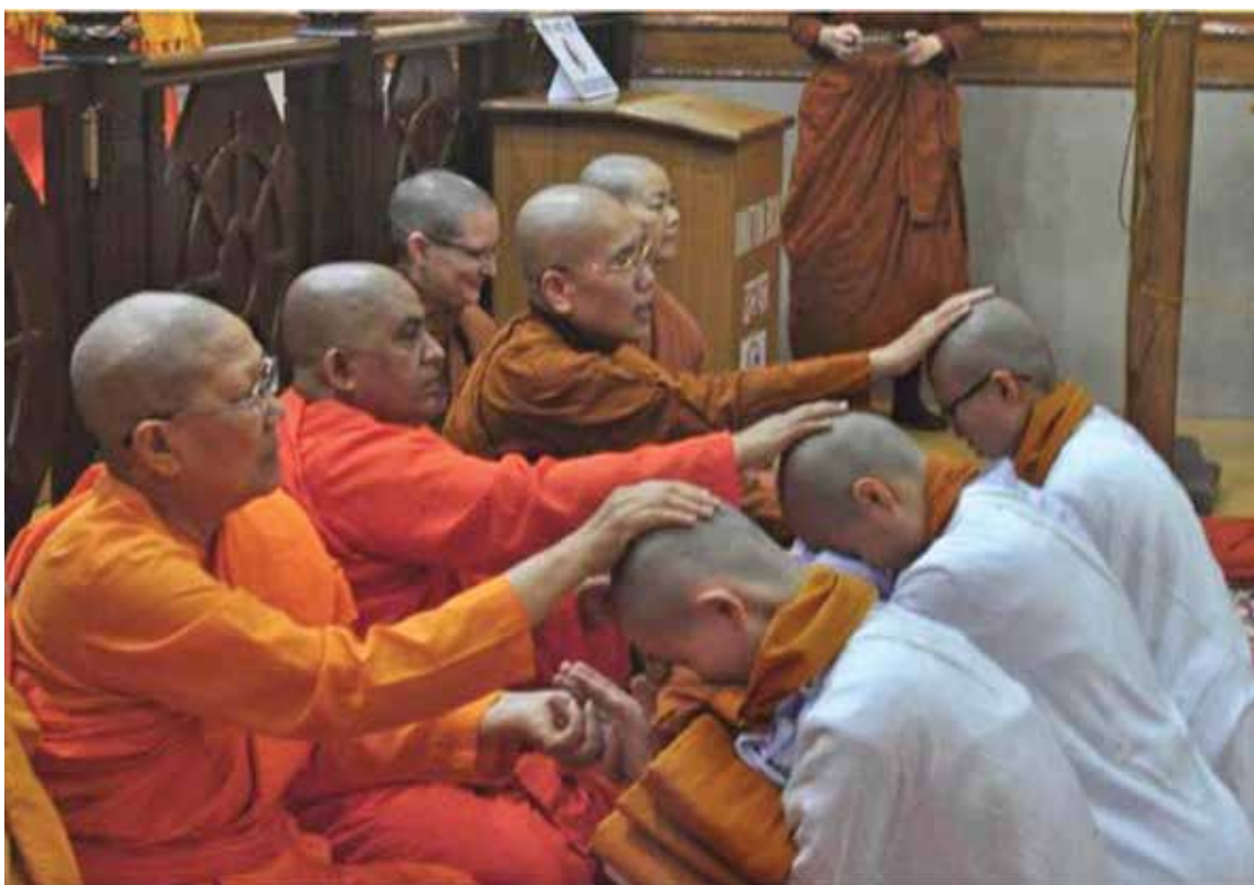
Candidates gather in front of images of the Buddha, Mahinda Thero and Sanghamitta Theri, while bhikkhuni preceptors instruct them in mindfulness training.