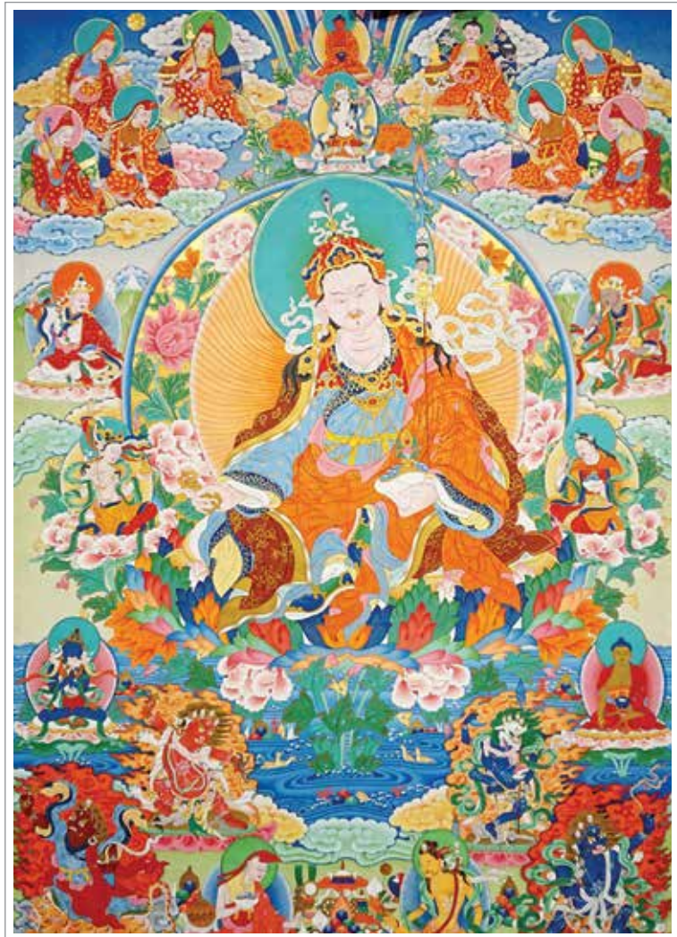
Guru Rinpoche Thangka

Kunchok Chidu of the Gatherings of all precious jewels