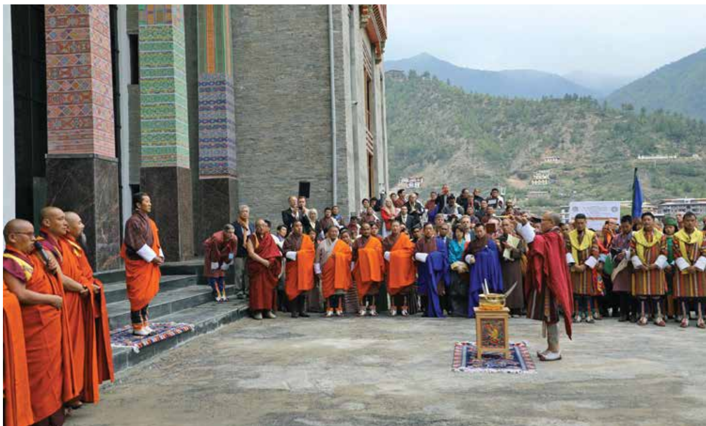
PM graces the opening ceremony of the Vajrayana conference in Zhichenkhar