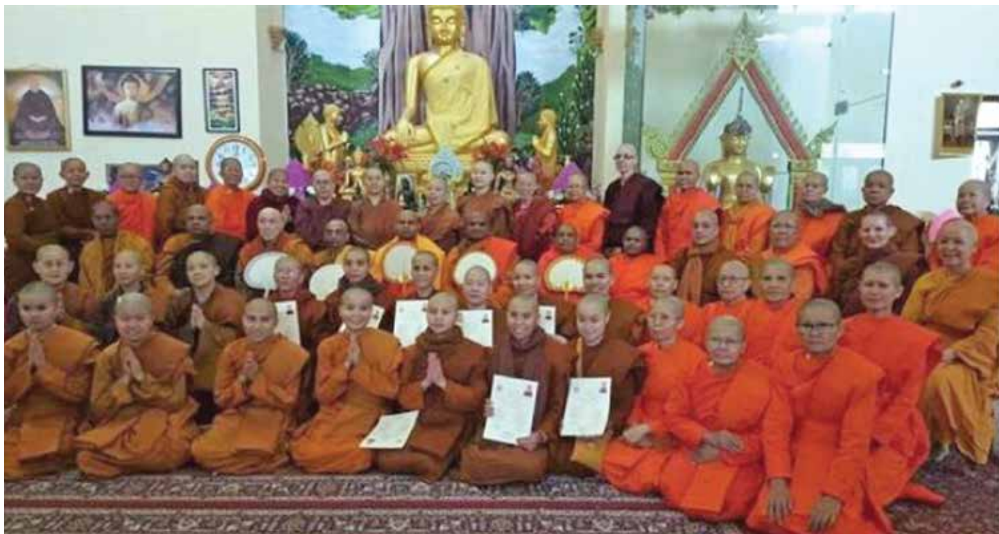
Fully accepted, fully ordained. New bhikkhunis with their teachers, preceptors and their ordaining Dual Sangha upon the completion of two full days of bhikkhuni ordinations.