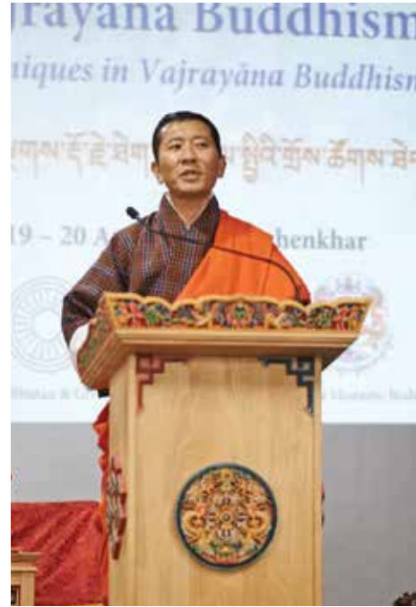
Bhutanese Prime Minister Lotay Tshering offers a keynote speech during the conference opening

Vesna A. Wallace talked about the early evidence of Kalachakra tantric tradition among the Mongols, and forming of tantric tradition in Mongol territories.