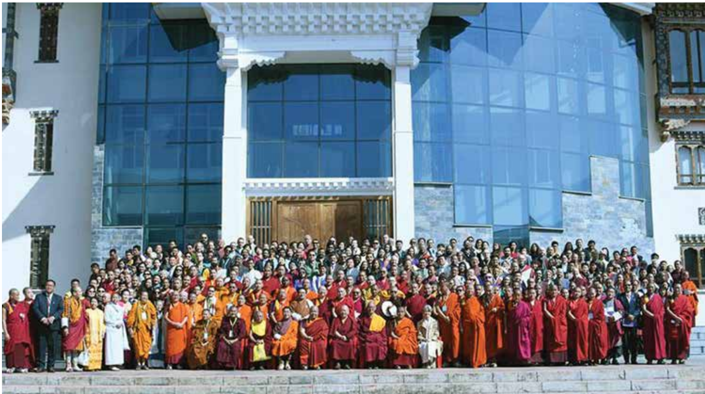
Dignitaries, delegates, guests, and participants of the Third International Vajrayana Conference in Thimphu

behind the conference, which is also one of the first pre-consecration events to be held in the country's new Library of Mind, Body, and Sound, established to fill the needs of those searching for spiritual and intellectual sustenance.