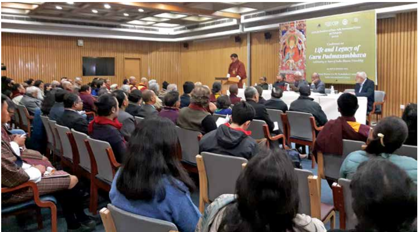
A glimpse of the conference proceedings

The conference was conducted through various thematic sessions dealing with various aspects of Guru's life, such as Life and Teachings, Local Contexts, Texts and Commentaries, Iconography, and Rituals and Mandala Drawings. The thoughtful and textured discussions in these sessions benefited from the important contributions of the high Lamas and eminent practitioners. These included Neten Chockling Rinpoche, Yongey Mingyur Rinpoche, Hungtrampa Sey Namkha Dorje, Khenpo