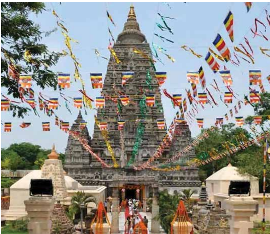
Maha Bodhi Temple, Bodhi Gaya

T he International Buddhist Confederation (IBC) is a Buddhist umbrella body that serves as a common platform for Buddhists worldwide. It currently has a membership comprising more than 300 organisations, both monastic and lay, in 39 countries.